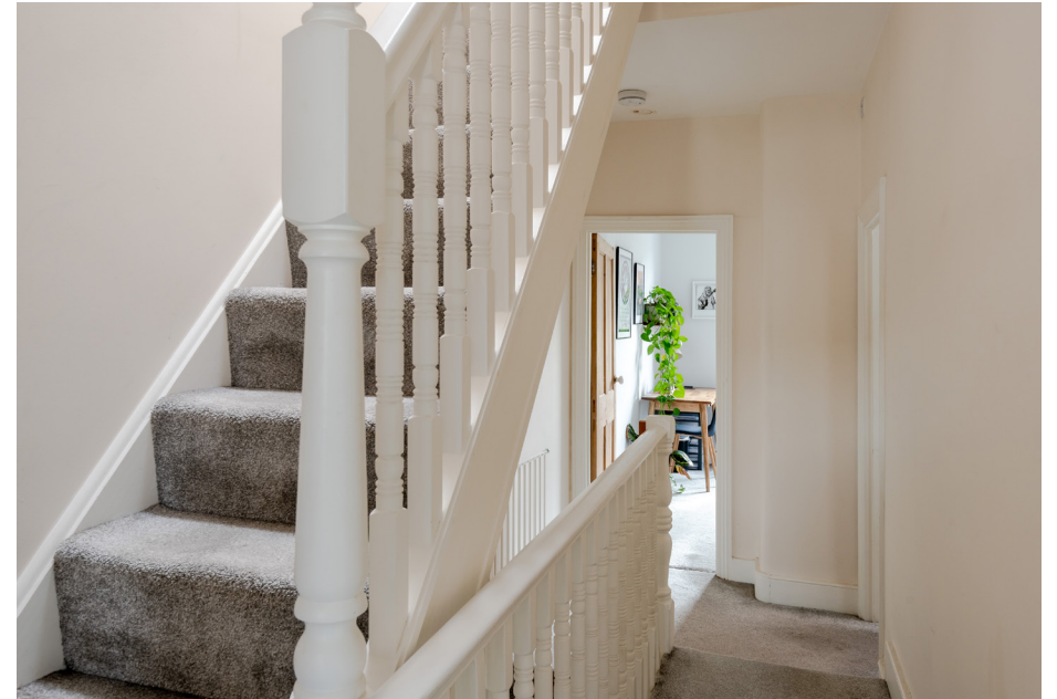
STAIRS TO SECOND FLOOR