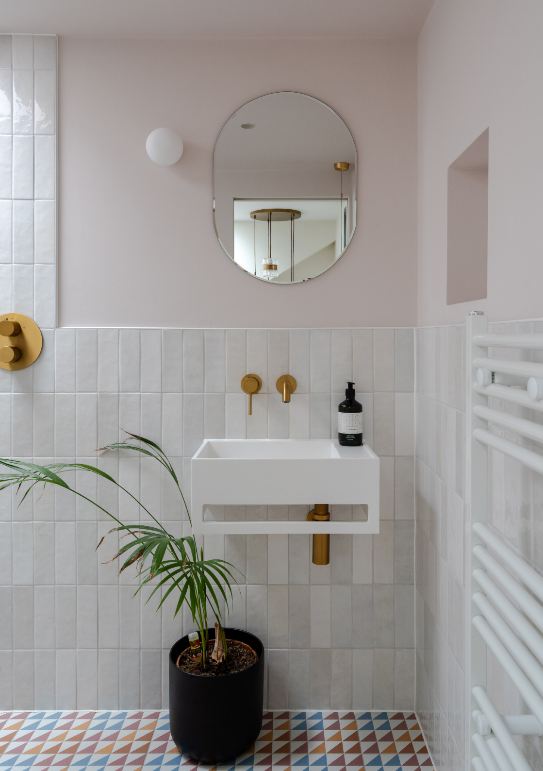
Second floor shower room