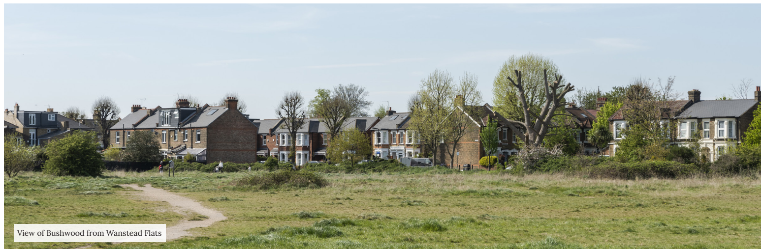
View of Bushwood from Wanstead Flats

Local schools rated 'Outstanding' by Ofsted include Davies Lane Primary (on the next road – four minutes' walk) and Acacia Nursery School (ten minutes). George Tomlinson Primary is also rated 'Good' (five minutes). Connaught School for Girls and Buxton Secondary are rated 'Good' by Ofsted, and both are around 15 minutes on foot.