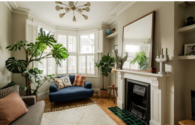
Front reception room