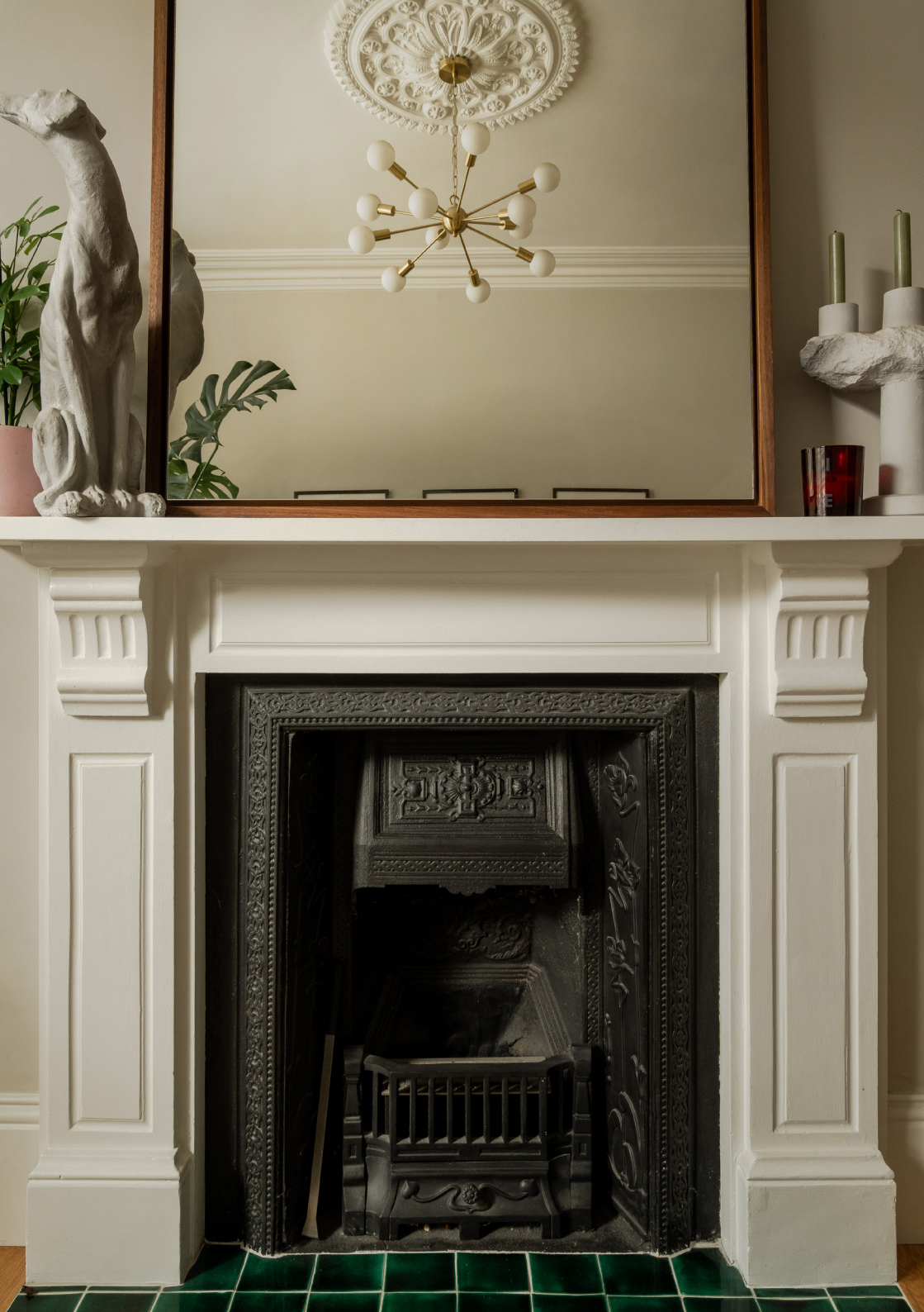
Front reception room