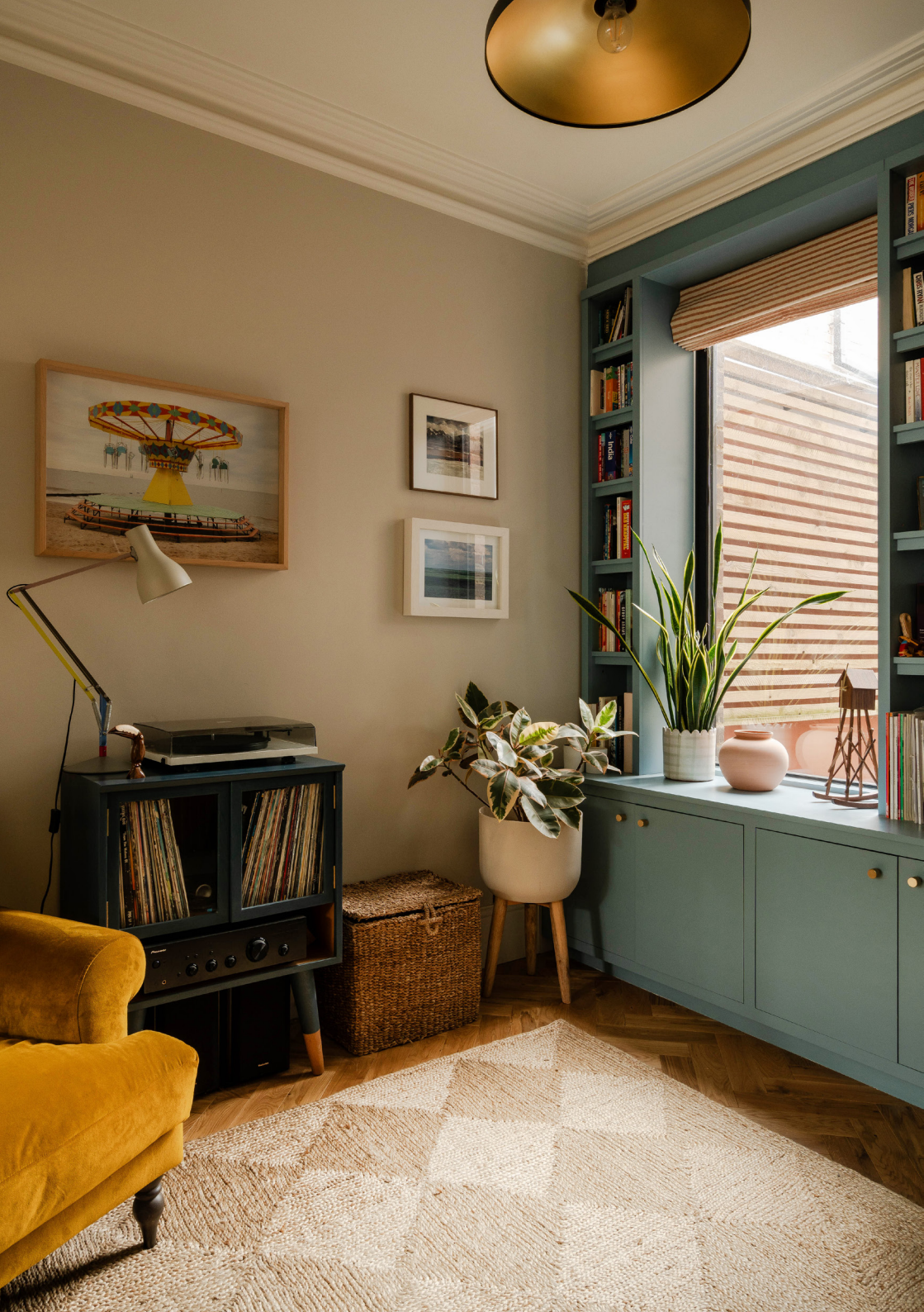
Rear reception room