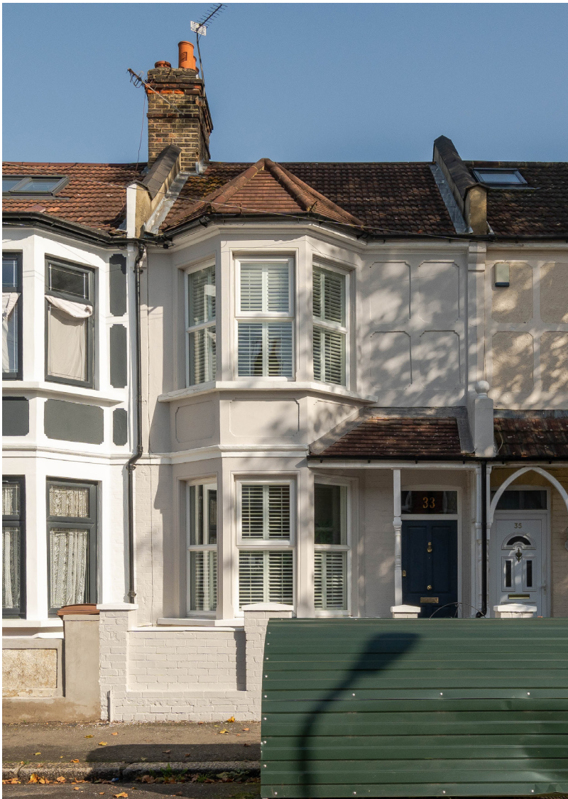
Front of house