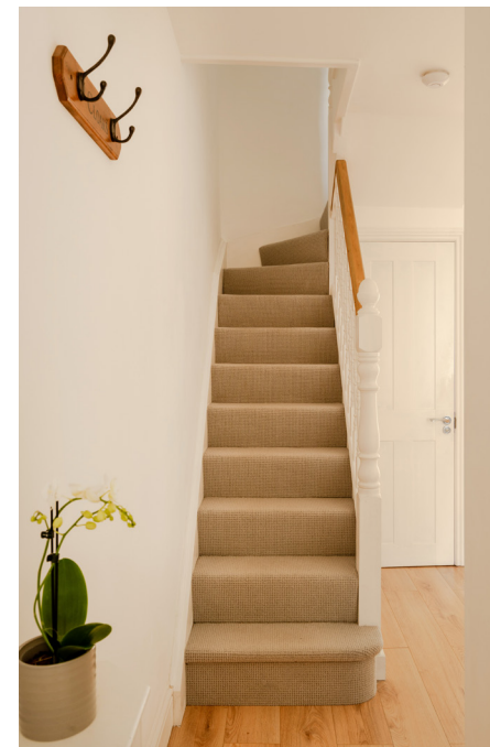
ENTRANCE & STAIRS