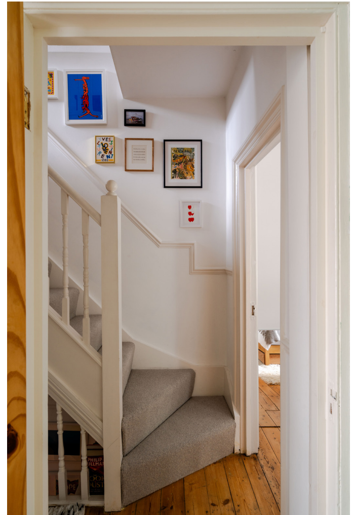
STAIRS TO SECOND FLOOR