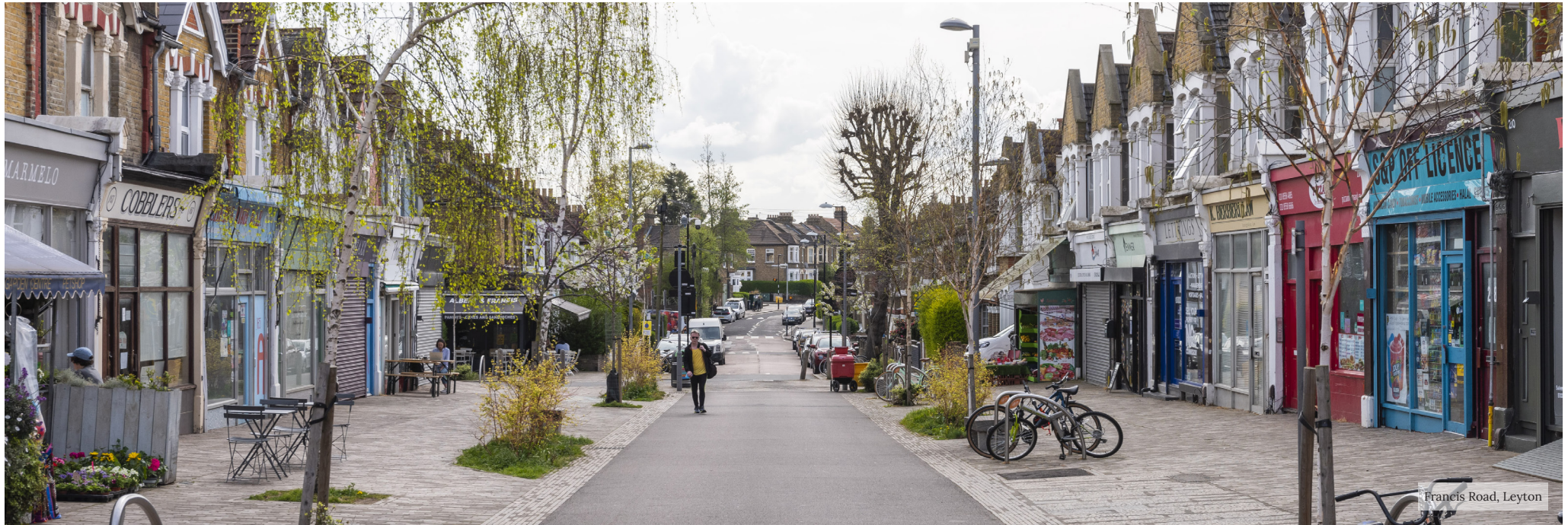
Francis Road, Leyton

Just moments from Francis Road, the location is one of Leyton's most constantly in demand, thanks to its urban village of independent local businesses. Firm favourites include Yardarm wine bar, Phlox bookstore, Edie Rose florist, Pause yoga studio, and Venner for gifts and homewares.