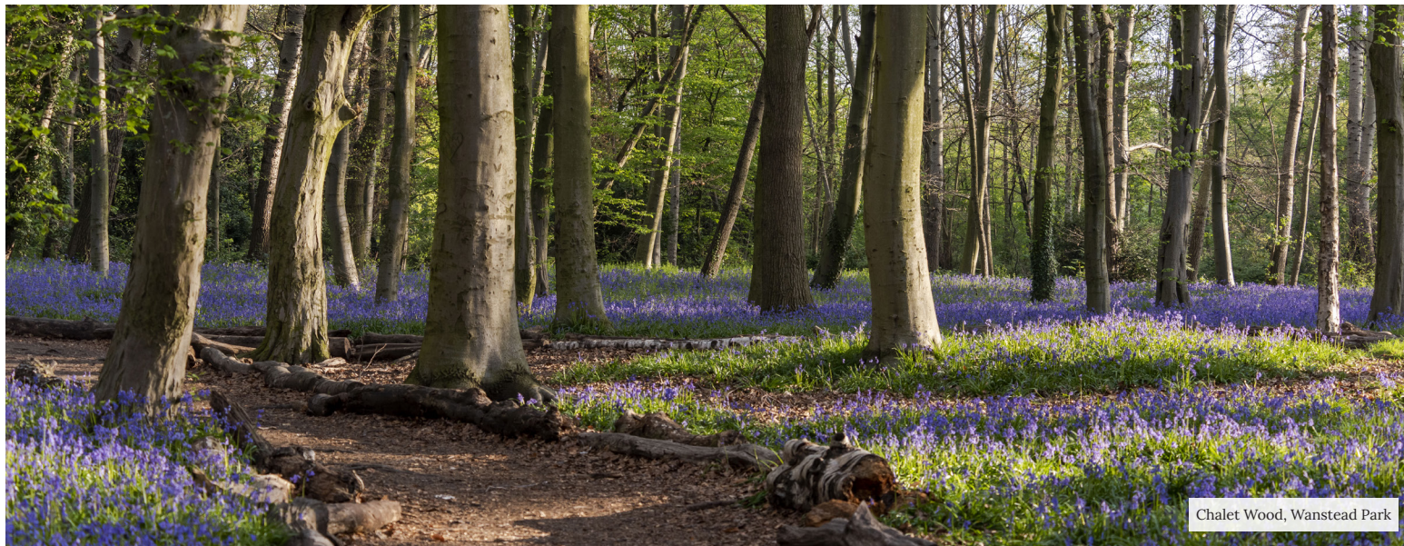
Chalet Wood, Wanstead Park

Nearby is the lovely Leytonstone Tavern (check out the fantastic burgers and roasts), the new coffee shop Tamping Grounds, Kotch for pizza, and The Rookwood Village pub with its stylish interior, deck and electronic darts. Stroll a few minutes further to explore Winchelsea Road's artisanal food and drink scene, including The Wanstead Tap, Rambles Café, and Wild Goose Bakery for custard tarts.