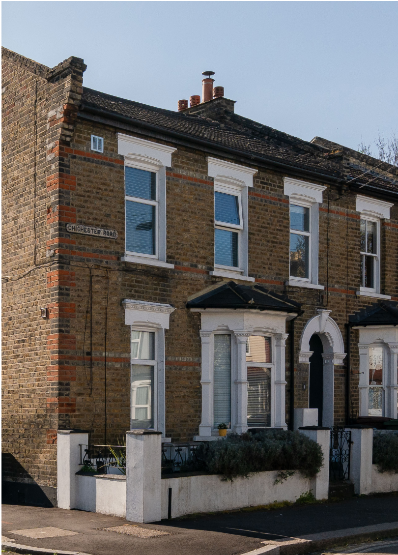
Front of house