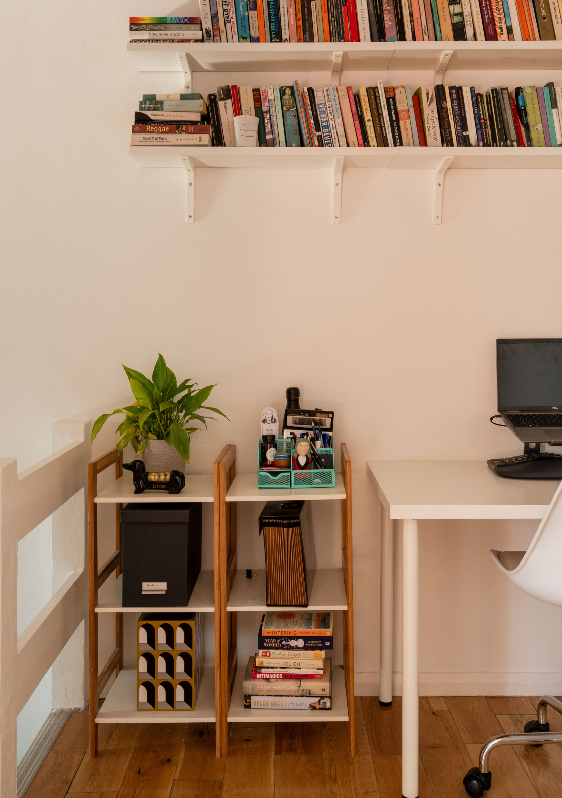
Landing / study area