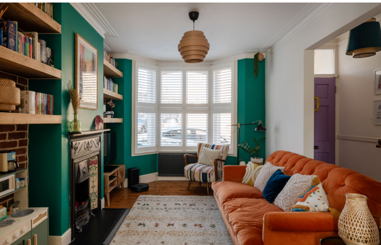
Reception / dining room