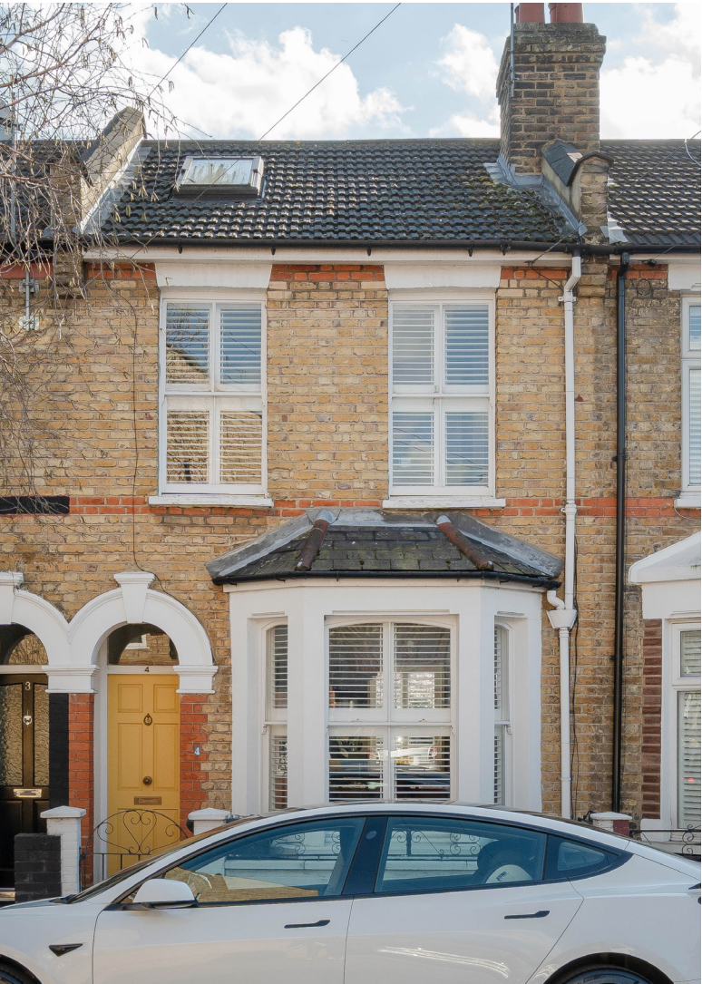
Front of house