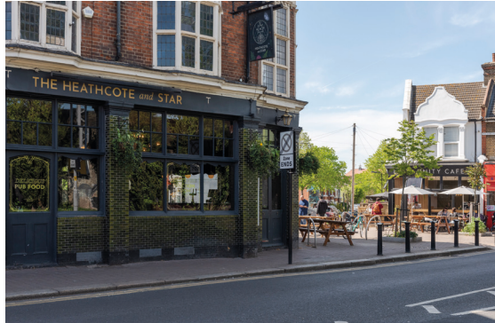
Heathcote and Star and Unity café

Lytton Road is an attractive and tree-lined residential avenue in sought-after Upper Leytonstone. It's about a 10-minute walk from Leytonstone Underground station (Central Line – 24 hours at weekends) and the High Road, where you'll find Overground services and such local favourites as The Red Lion pub, Le Petit Corner café, and Wild Goose Bakery.