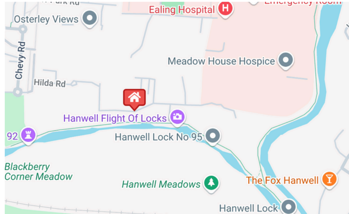
Illustration for identification purposes only. Not to scale.

Hilda Road, UB2 Approximate Gross Internal Area 75.81 SQ.M / 816 SQ.FT