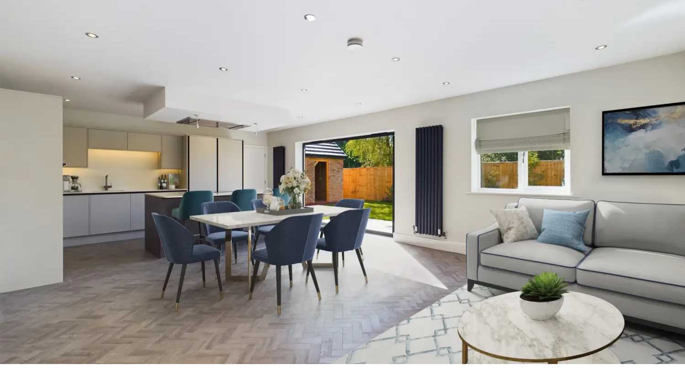
1 Newsham Court Newsham Hall Lane, Woodplumpton Preston