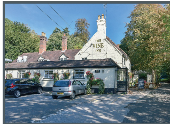
The Vine Inn, Clent - a favourite local haunt