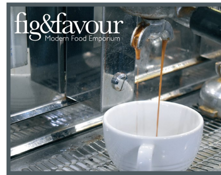
fig & favour - modern food emporium