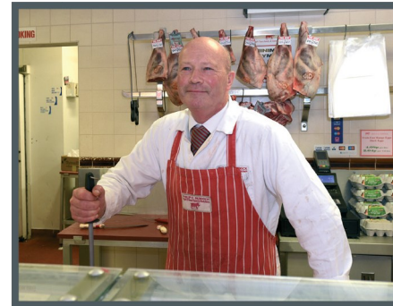
Paddocks - choice cuts from the choice of villagers