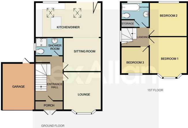
Whilst every attempt has been made to ensure the accuracy of the floor plan contained here, measurements of doors, windows, rooms and any other items are approximate and no responsibility is taken for any error, omission, or mis-statement. This plan is for illustrative purposes only and should be used as such by any prospective purchaser. The services, systems and appliances shown have not been tested and no guarantee as to their operability or efficiency can be given. Made with Metropix v2021

References to the tenure of a property are based on information supplied by the seller. We are advised that the property is freehold. A buyer is advised to obtain verification from their solicitor.