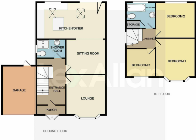
Whilst every attempt has been made to ensure the accuracy of the floor plan contained here, measurements of doors, windows, rooms and any other items are approximate and no responsibility is taken for any error, omission, or mis-statement. This plan is for illustrative purposes only and should be used as such by any prospective purchaser. The services, systems and appliances shown have not been tested and no guarantee as to their operability or efficiency can be given. Made with Metropix v2021

VIEWING View by appointment only with Lex Allan. Opening times: Monday - Friday 9.00am to 5.30pm, Saturday 9.00am to 4.00pm.