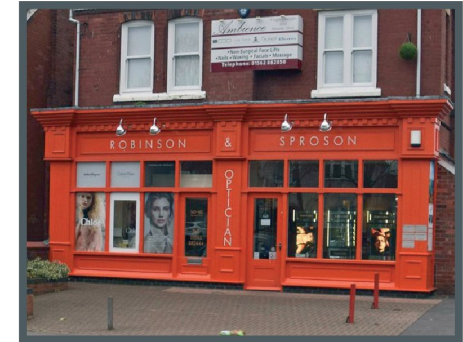
Robinson & Sproson - professional eye care