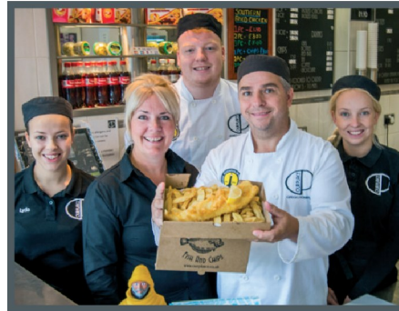
Our PlaiCe - award-winning fish & chips