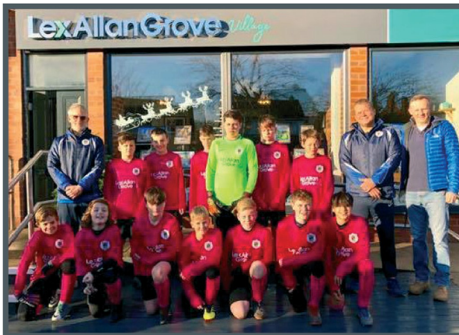
West Hagley Football Club Under 13s in their new Lex Allan Grove Village shirts