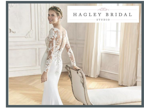
Hagley Bridal Studio - exceptional service