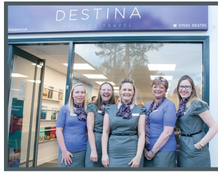
Destina by Good Travel - dedicated travel experts