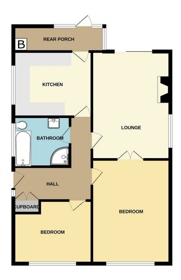
Whilst every attempt has been made to ensure the accuracy of the floorplan contained here, measurements of doors, windows, comes and any other items are approximate and no responsibility is taken for any error, omission or mis-statement. This plan is for illustrative purposes only and should be used as such by any prospective purchaser. The services, systems and appliances shown have not been tested and no guarantee as to their operability or efficiency can be given.