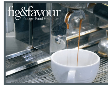
fig & favour - modern food emporium