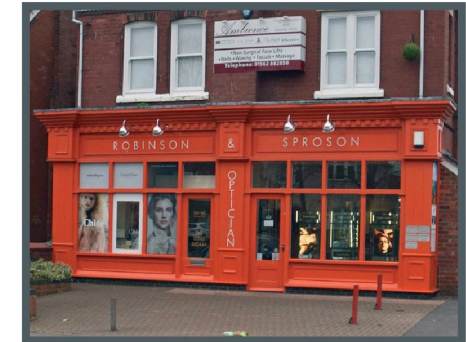
Robinson & Sproson - professional eye care