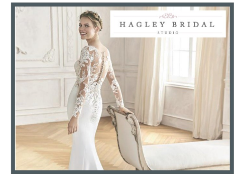
Hagley Bridal Studio - exceptional service