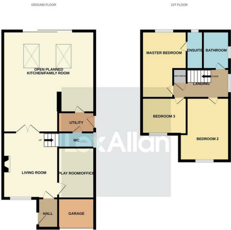
78 RICHARDSON DRIVE, STOURBRIDGE, DY8 4DN

VIEWING View by appointment only with Lex Allan. Opening times: Monday - Friday 9.00am to 5.30pm, Saturday 9.00am to 4.00pm.