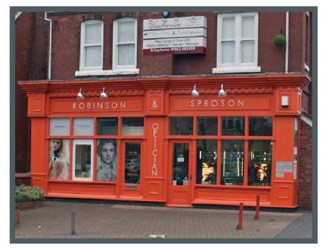
Robinson & Sproson - professional eye care