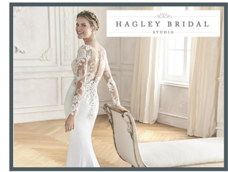
Hagley Bridal Studio - exceptional service