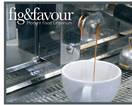
fig & favour - modern food emporium