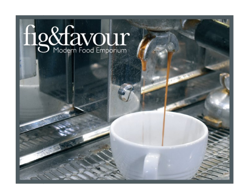
fig & favour - modern food emporium