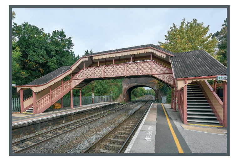
Hagley Train Station