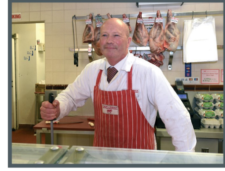
Paddocks - choice cuts from the choice of villagers