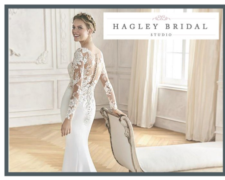
Hagley Bridal Studio - exceptional service