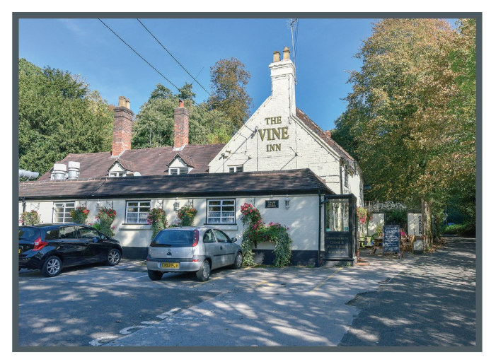
The Vine Inn, Clent - a favourite local haunt