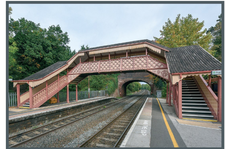
Hagley Train Station