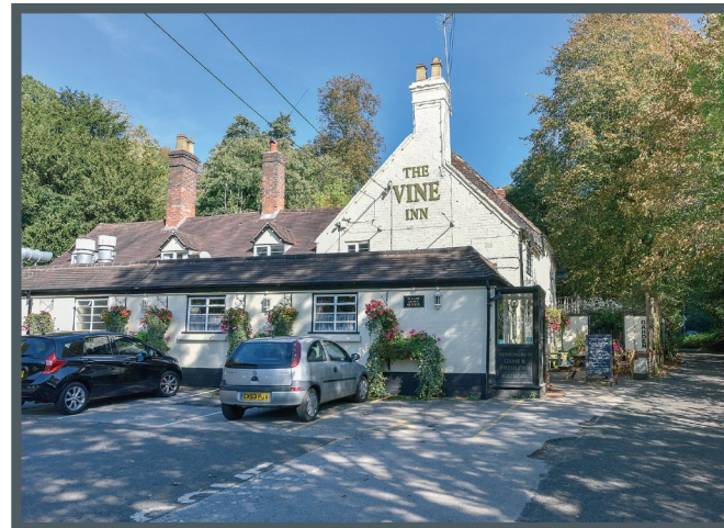
The Vine Inn, Clent - a favourite local haunt