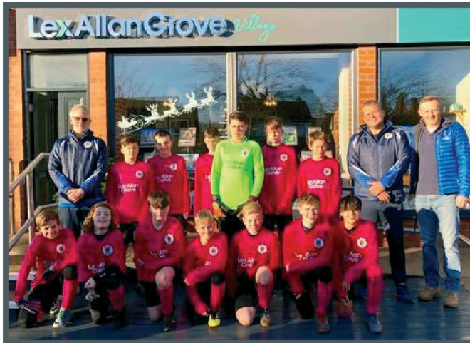
West Hagley Football Club Under 13s in their new Lex Allan Grove Village shirts