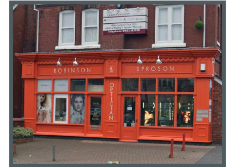
Robinson & Sproson - professional eye care