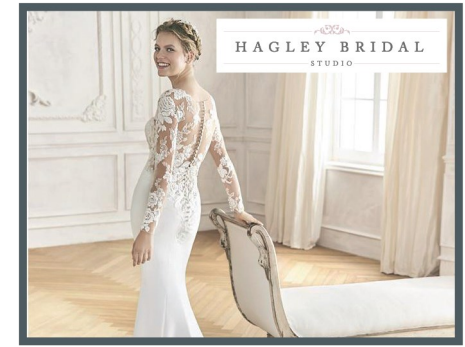
Hagley Bridal Studio - exceptional service