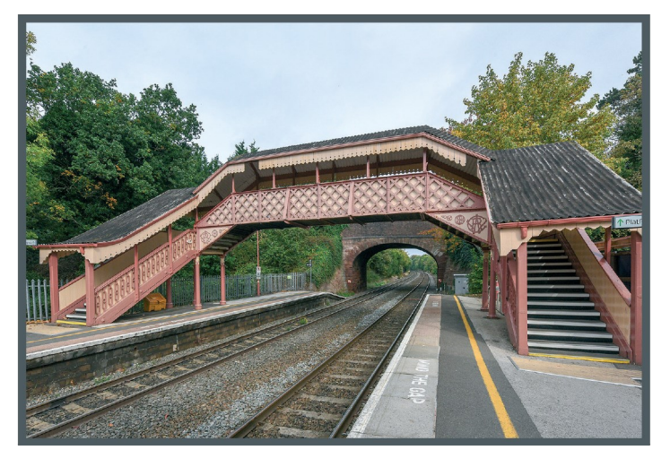
Hagley Train Station