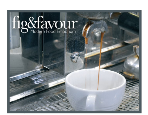
fig & favour - modern food emporium