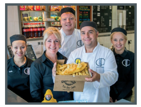
Our Plaice - award-winning fish & chips