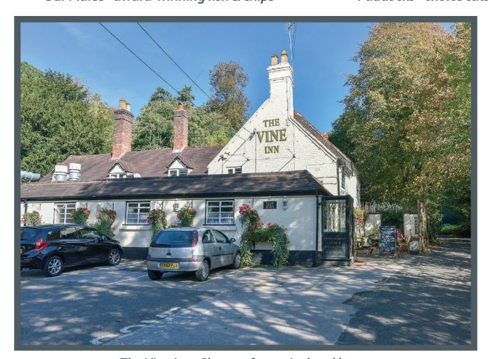
The Vine Inn, Clent - a favourite local haunt