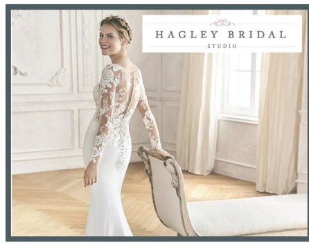
Hagley Bridal Studio - exceptional service