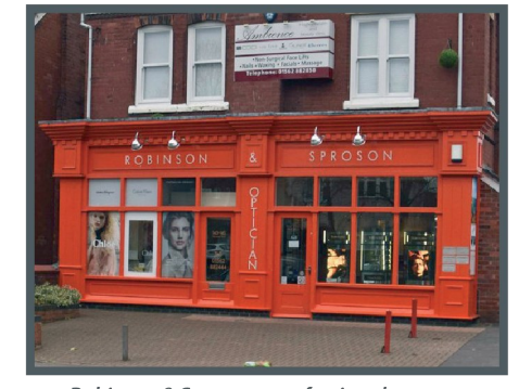
Robinson & Sproson - professional eye care