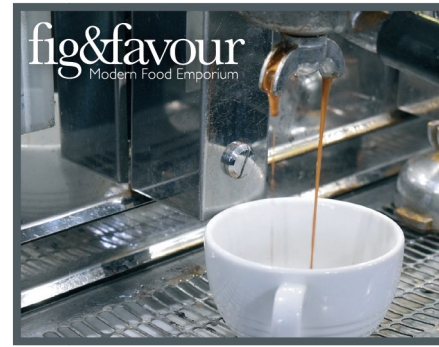
fig & favour - modern food emporium