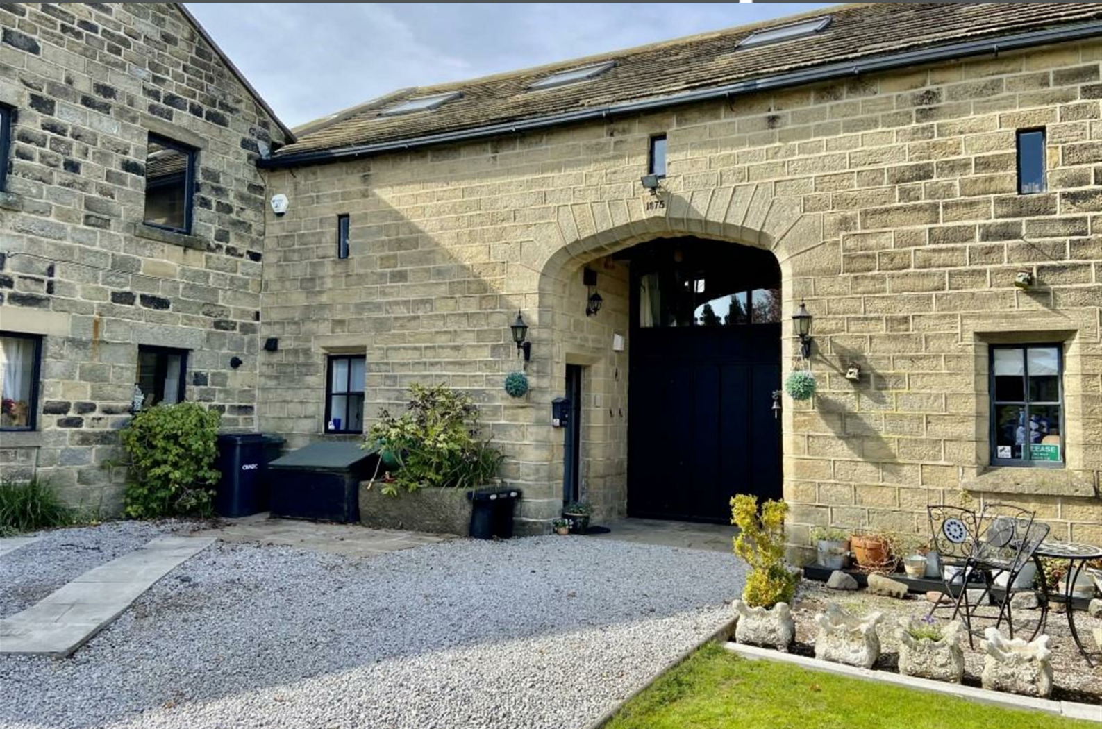
Springfield Barn (bedsit) Haworth Road, Cullingworth, BD13 5EE