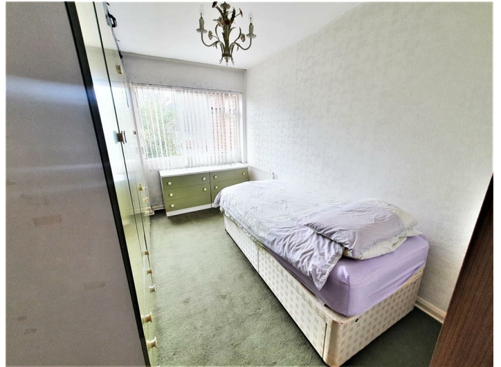
Laid to carpet, fitted wardrobes.