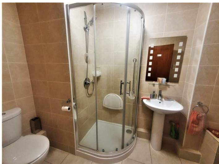
Shower Room 6'6x9'5 (1.98mx2.87m)

Low level W/C, Corner shower, Pedestal hand basin.