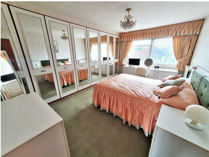
Laid to carpet, Range of fitted wardrobes,