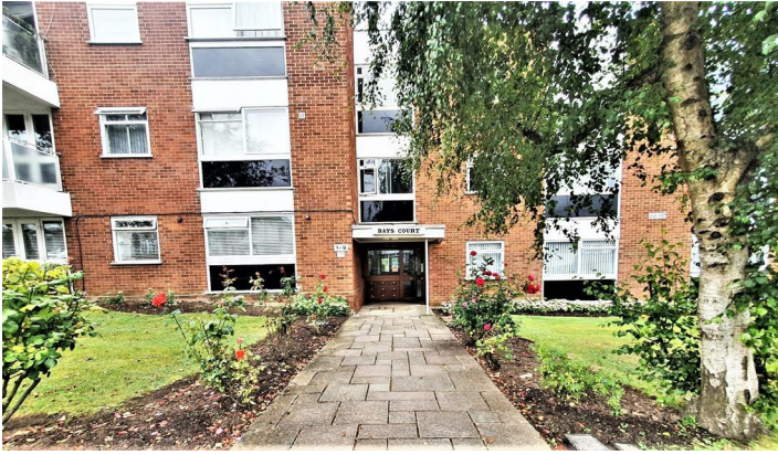
Main front entrance, door to rear for shared garden.