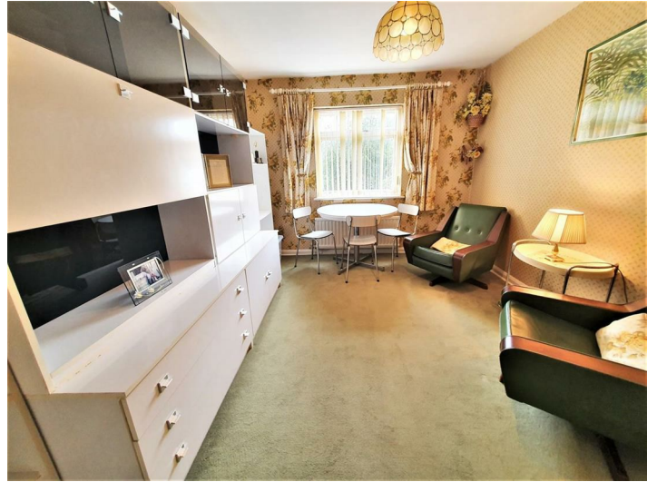
Laid to carpet, range of fitted cupboards.