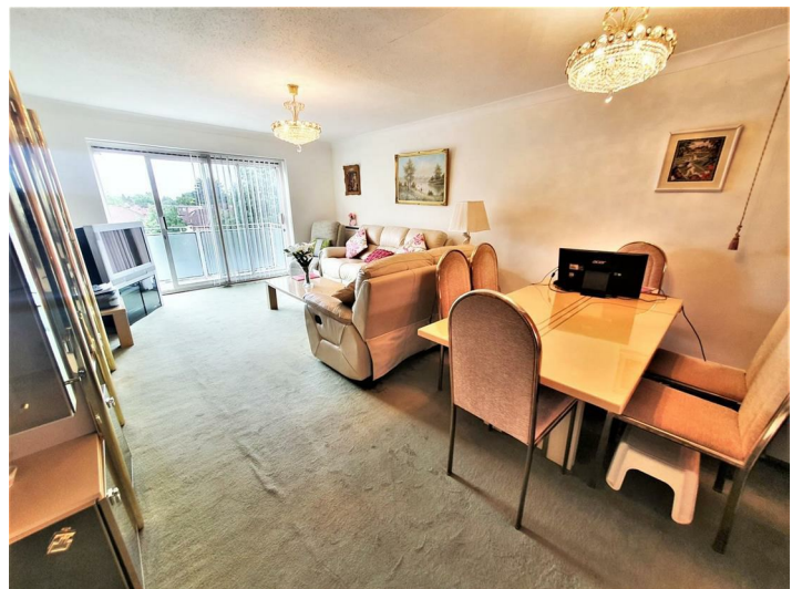
Large sized room featuring a balcony, Laid to carpet