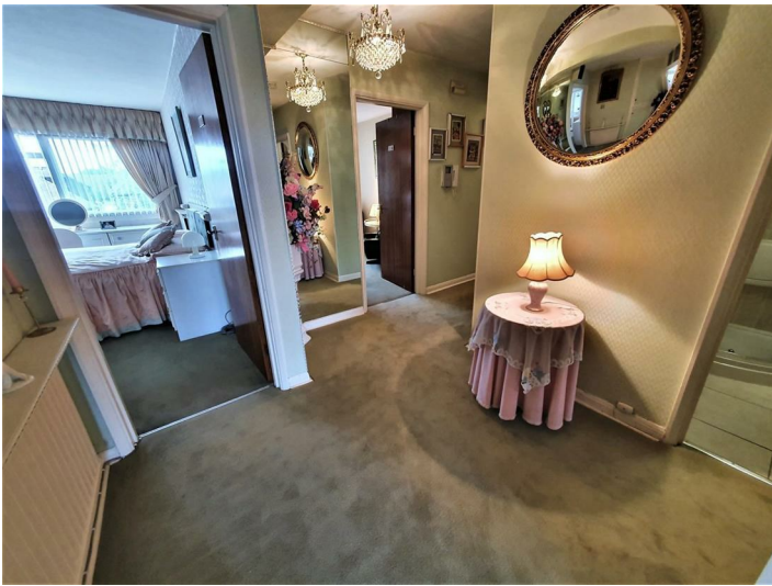
L shaped hallway leading to all rooms, carpeted throughout, airing cupboard housing water cylinder, large storage cupboard.