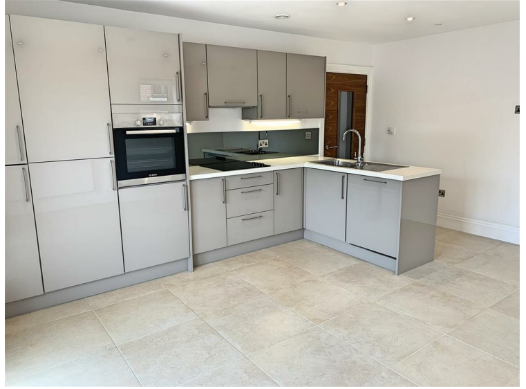
Reception Room/Open Plan Kitchen: