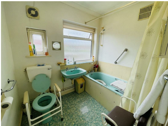
Bathroom 7'3" x 6'2" (2.21m x 1.90m)