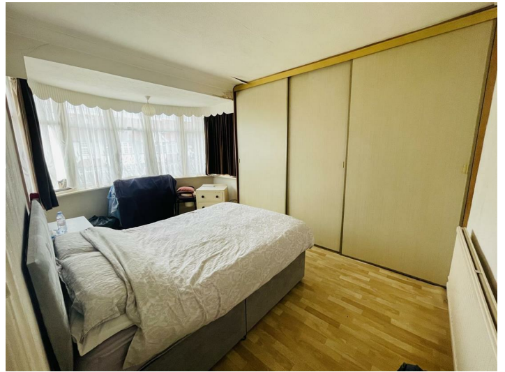
Bedroom One 10'2" x 13'10" (3.11m x 4.22m )