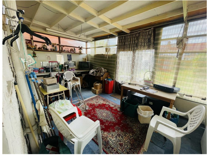
Conservatory 17'5" x 9'7" (5.31m x 2.93m)