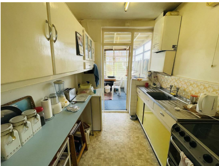
Kitchen 6'9" x 7'5" (2.08m x 2.28m)