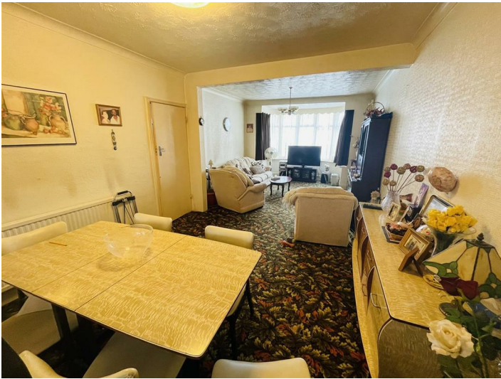
Reception 11'8" x 25'11" (3.58m x 7.90m)