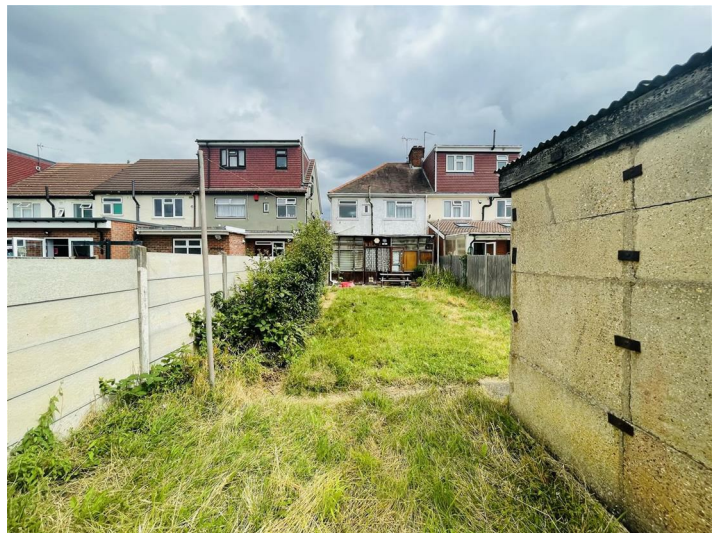
Alternate View - Garden