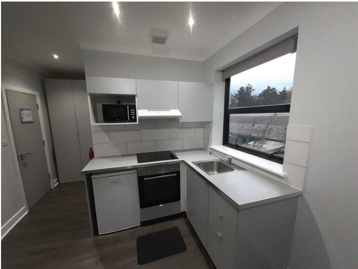
Kitchen area with lots of cupboard space, with microwave and oven