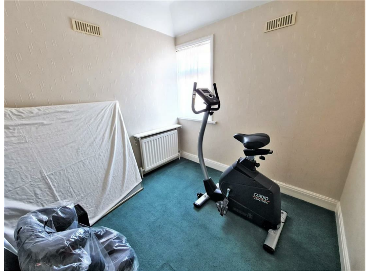
Built in wardrobes, laid to carpet