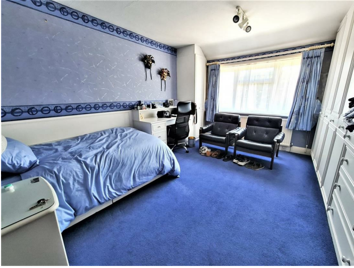
Built in wardrobes, window to rear aspect, laid to carpet