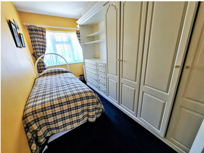
Built in wardrobes, window to front aspect, laid to carpet