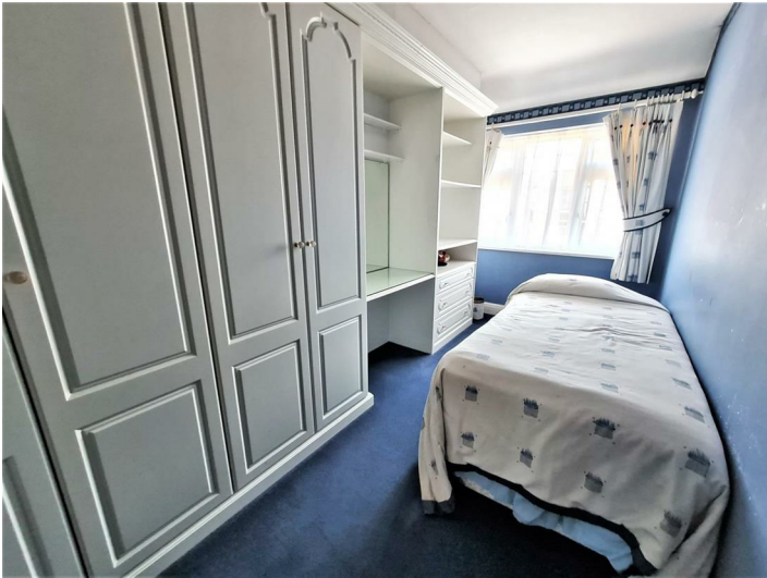
Built in wardrobes, window to rear aspect, laid to carpet