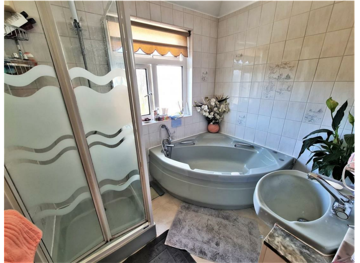
Corner bath with shower attachment, walk in shower, wall attached sink unit with mixer tap, fully tiled, frosted window to rear aspect