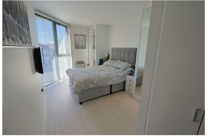
Bedroom One 19'11 x 9' (6.07m x 2.74m)