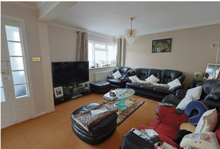
Reception Room 18'7 x 13'7 (5.66m x 4.14m)