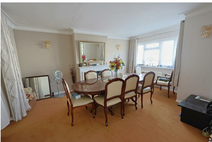
Reception Room (Dining Room) 16' x 13'4 (4.88m x 4.06m)