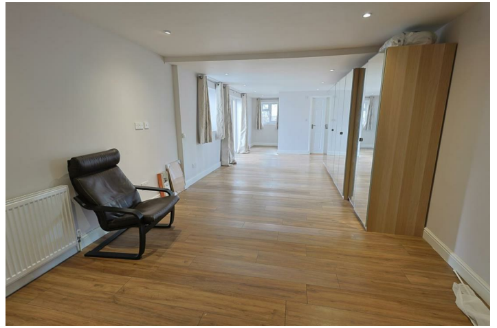
Side and Rear aspect windows, Patio doors to garden, door to shower Room.