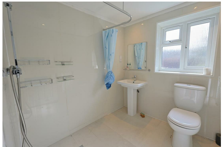
Rear aspect window, wall mounted shower, wash hand basin, low level WC