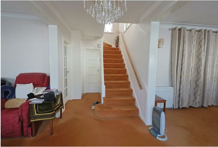
Stairs to first floor