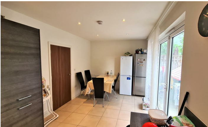
Dining room 11'4" x 9'8" (3.46 x 2.95)