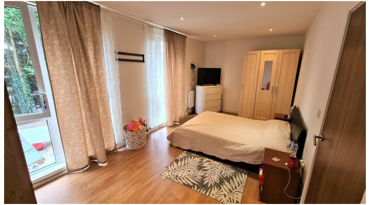
Living Room 18'8" x 9'8" (5.71 x 2.95)