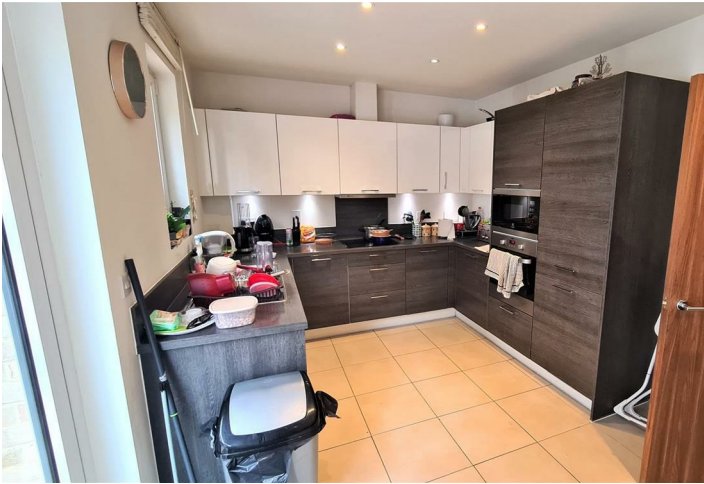
Kitchen 7'4" x 9'8" (2.25 x 2.95)