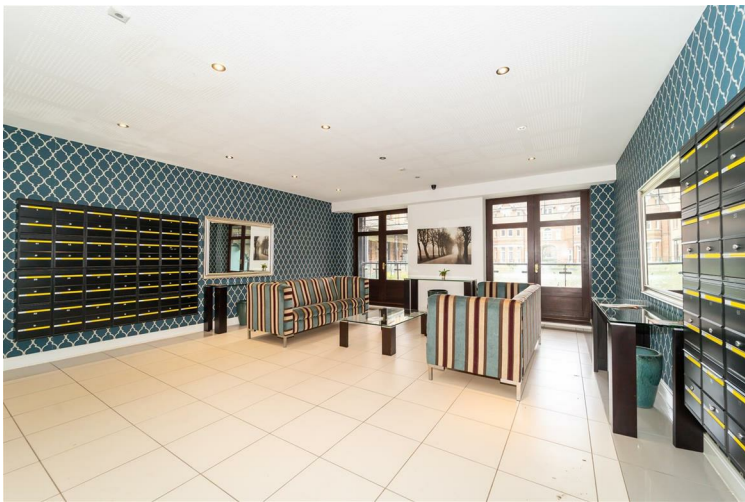
Communal Entrance Hall: