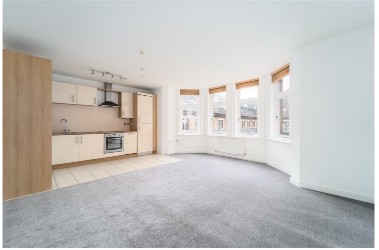
Reception Room/Open Plan Kitchen: