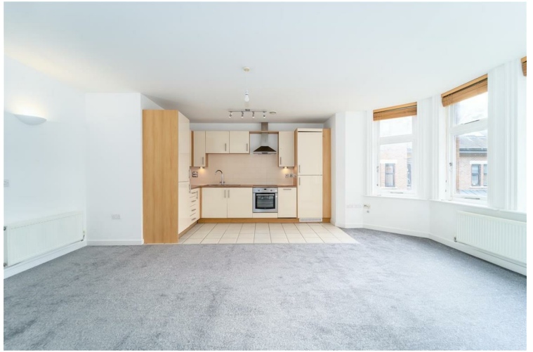
Reception Room/Open Plan Kitchen: