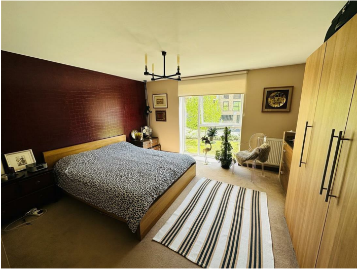
First Bedroom 18'8 x 13'4 (5.69m x 4.06m)