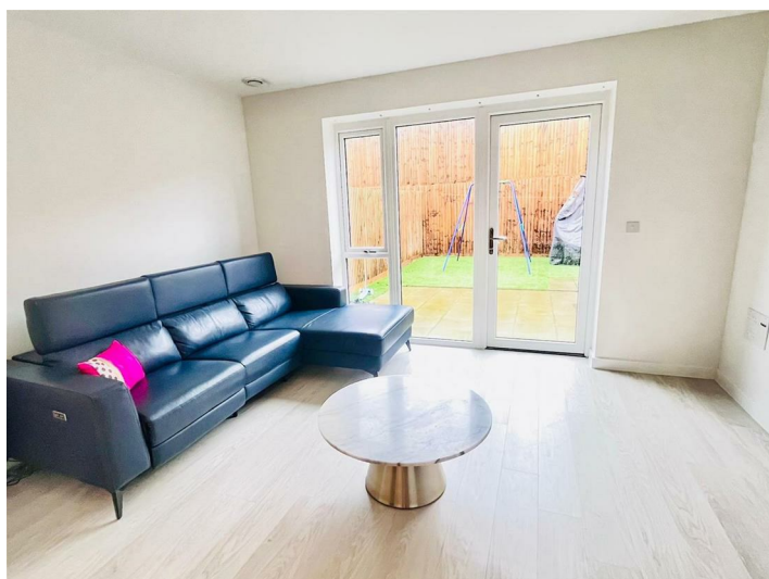
Reception Room 13'8 x 9'10 (4.17m x 3.00m)