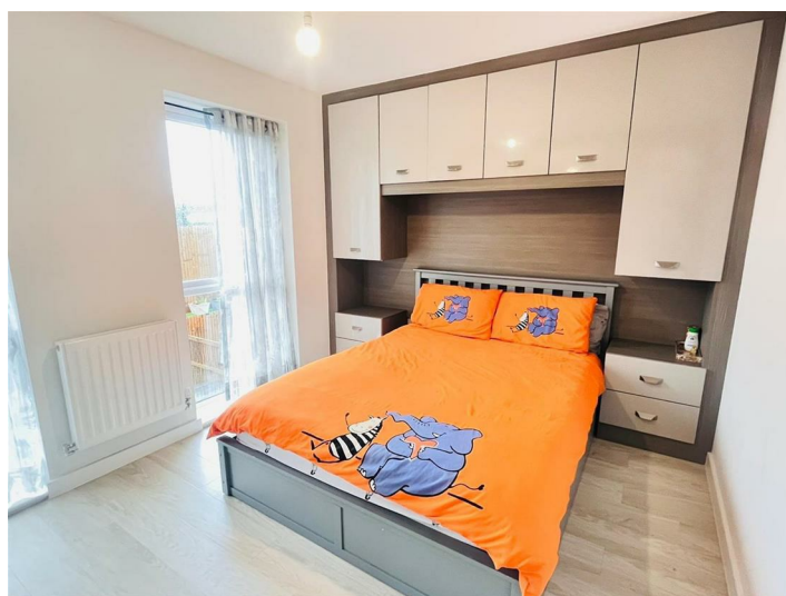
Second Bedroom 13'5 x 9'9 (4.09m x 2.97m)