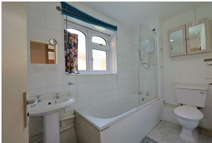
Bathroom 4'11" x 8'10" (1.50 x 2.70)