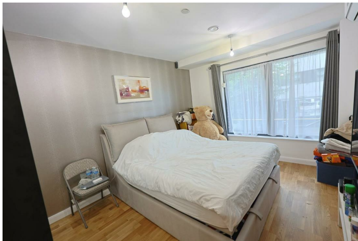
Bedroom 13'10" x 10'4" (4.22 x 3.16)