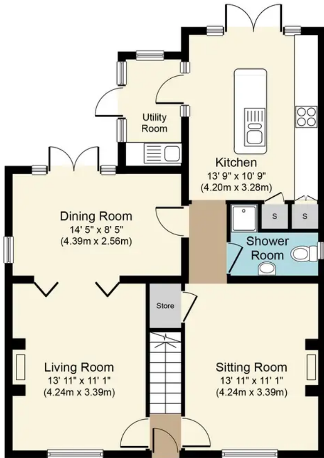
Ground Floor Approximate Floor Area 764 sq.ft. (70.9 sq.m.)