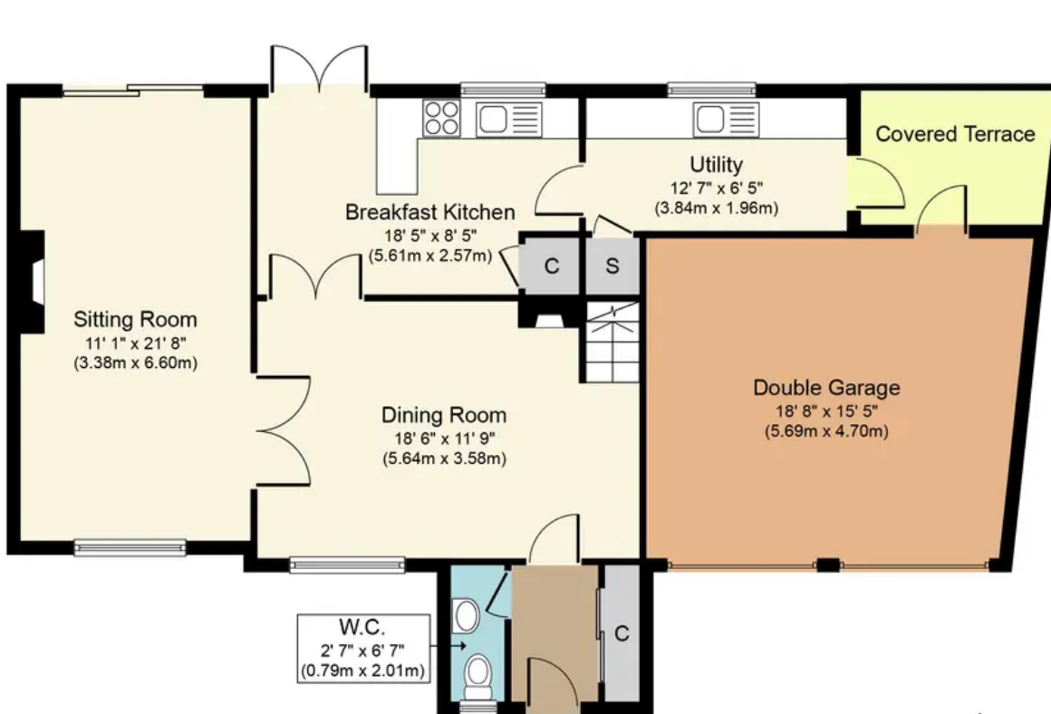
Ground Floor Approximate Floor Area 1,063 sq. ft. (98.8 sq. m.)