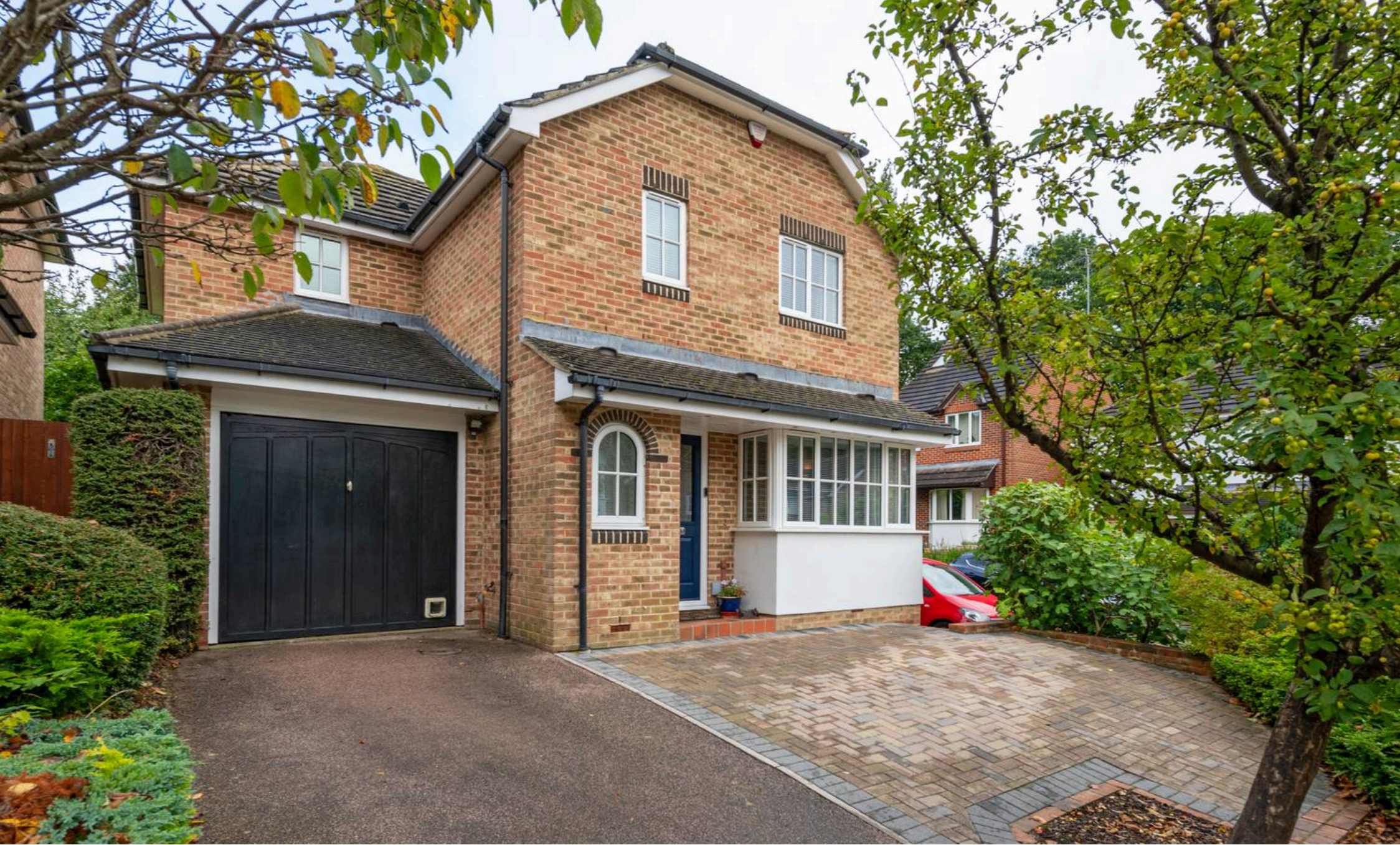
2 Chaldon Close Redhill