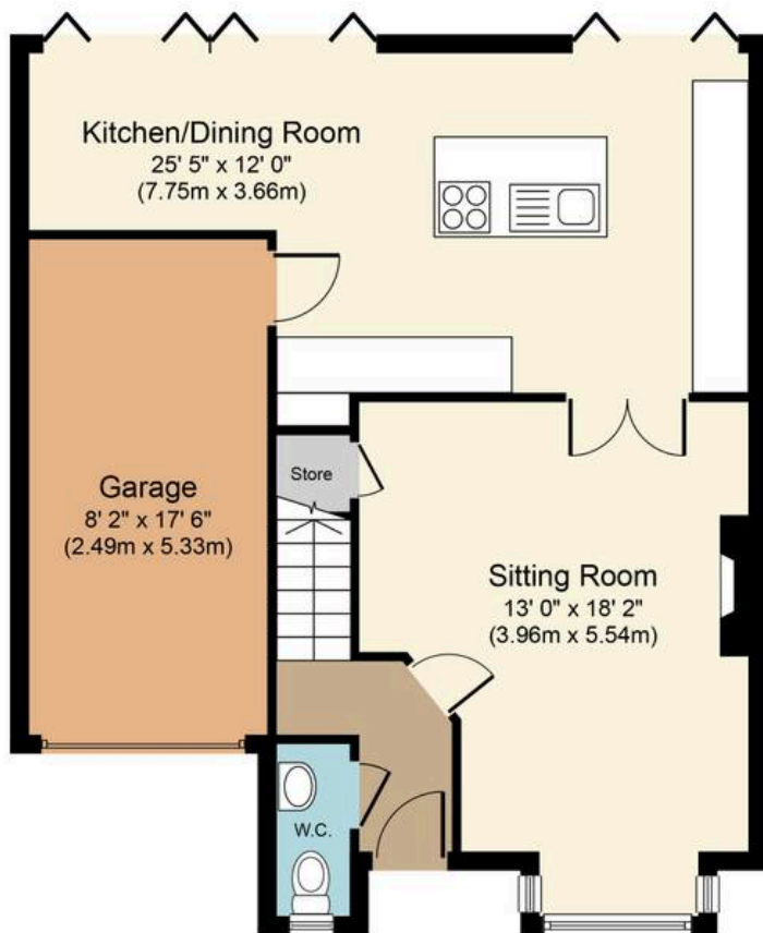
Ground Floor Approximate Floor Area 700 sq. ft. (65.0 sq. m.)