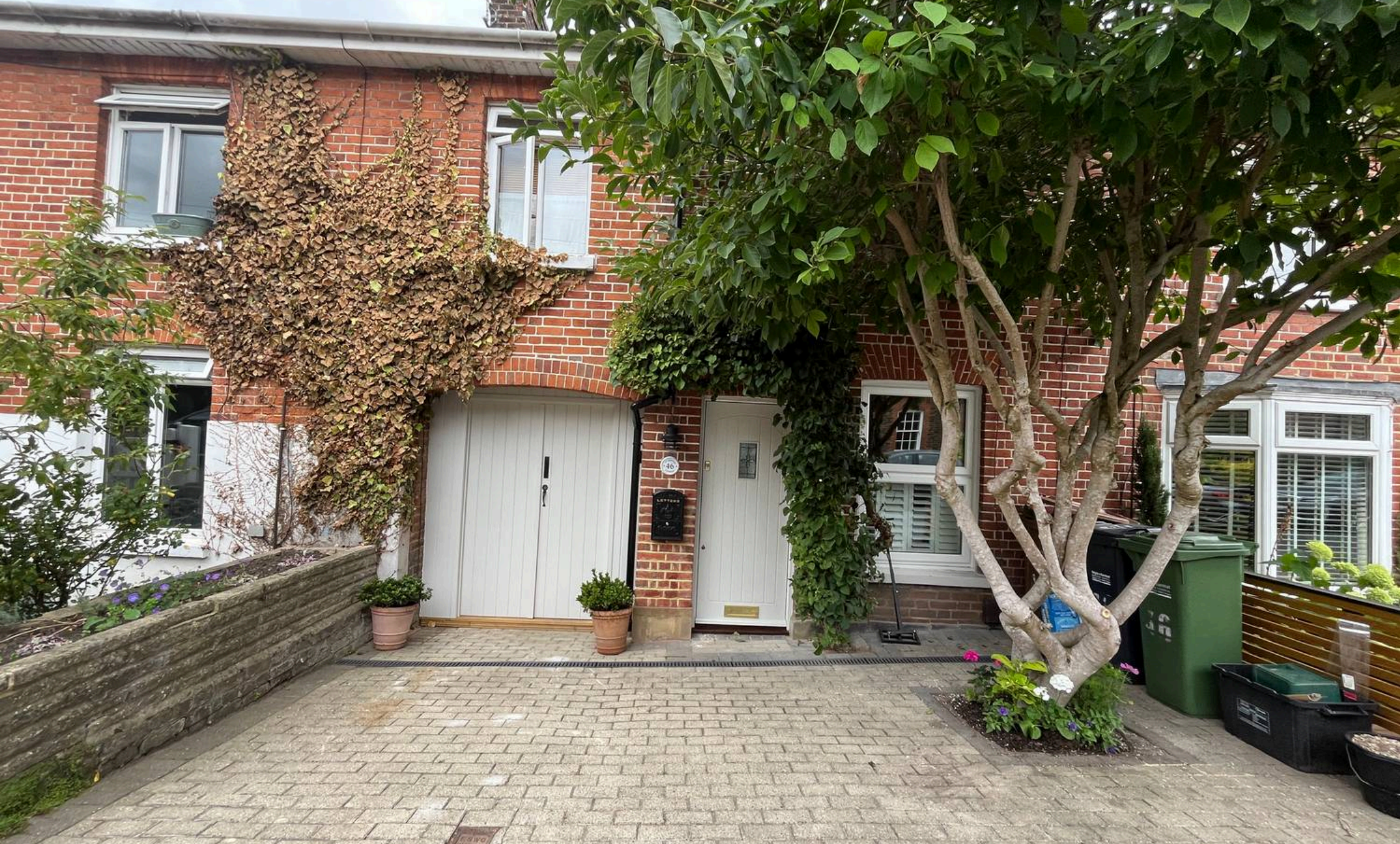
Priory Road Reigate