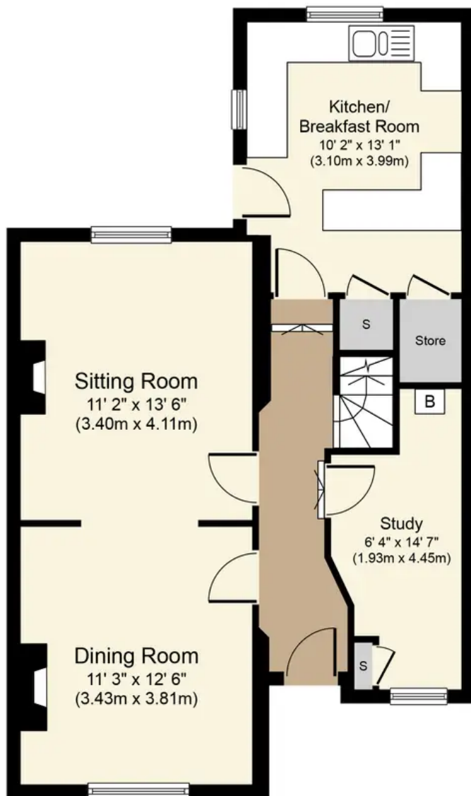
Ground Floor Approximate Floor Area 628 sq. ft. (58.3 sq. m.)