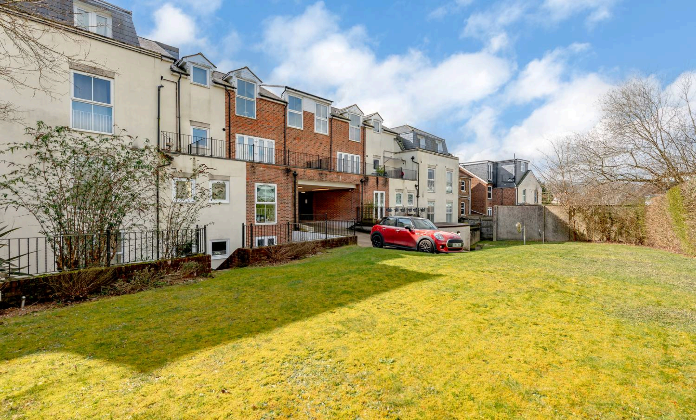
Flat 2, Fonteyn Court Lesbourne Road. Reigate