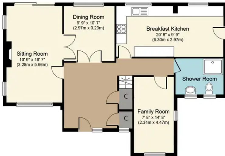
Ground Floor Approximate Floor Area 869 sq. ft. (80.7 sq. m.)