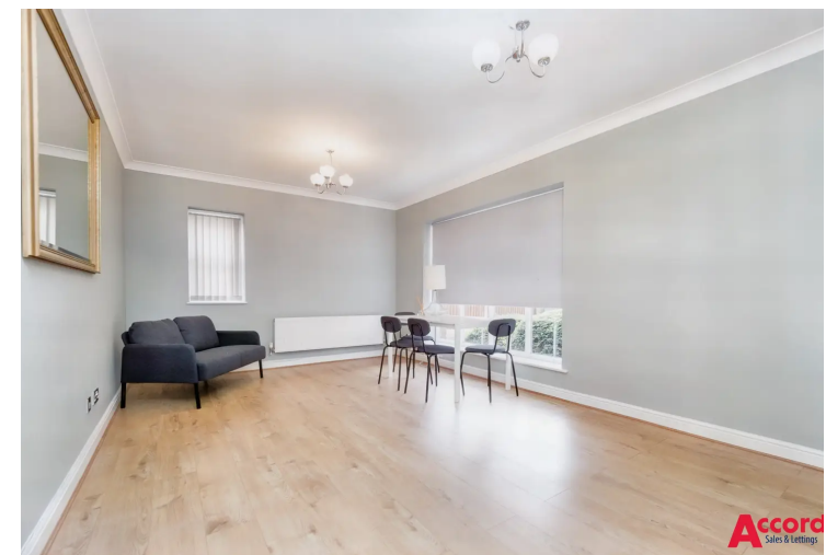
Flat 10, St. Kathryns Place Deyncourt Gardens, Upminster £425,000 Leasehold

NO ONWARD CHAIN • GROUND FLOOR APARTMENT • TWO DOUBLE BEDROOMS • RECENTLY FITTED EN-SUITE SHOWER ROOM • IDEALLY LOCATED FOR UPMINSTER STATION, SHOPS AND LOCAL AMENITIES • MODERN KITCHEN AND BATHROOM • ALLOCATED PARKING IN GATED CAR PARK • COMMUNAL GARDENS