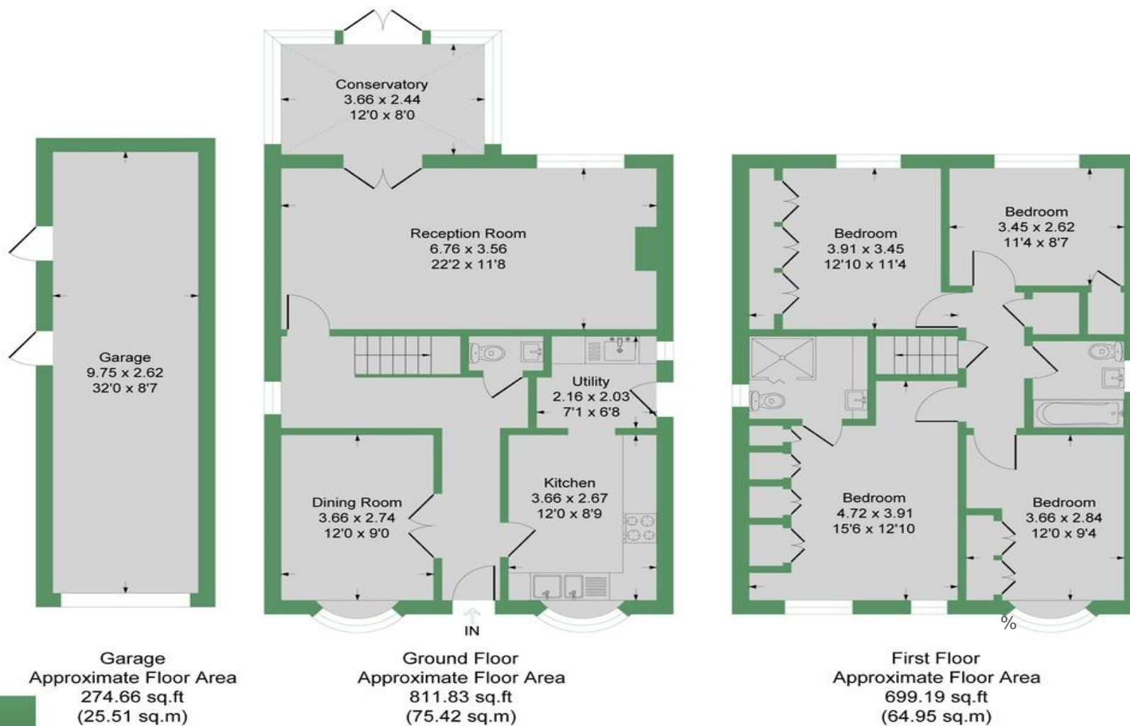
Illustration for identification purposes only, measurements are approximate, not to scale. Produced By Esjay Property Marketing

Approximate Gross Internal Floor Area = 165.8 sq m / 1786 sq ft