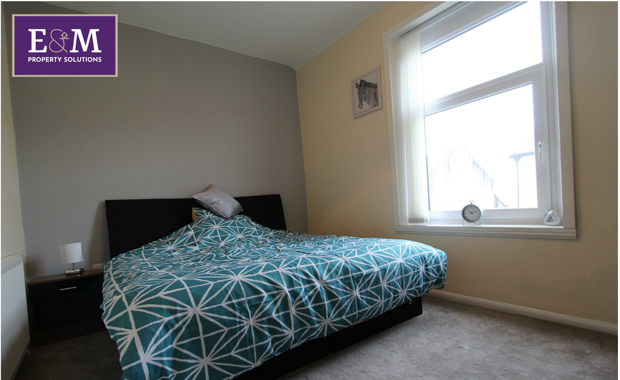
Room 2, 137 Briercliffe Road, Burnley, Lancashire, BB10 1XA £100 Per week