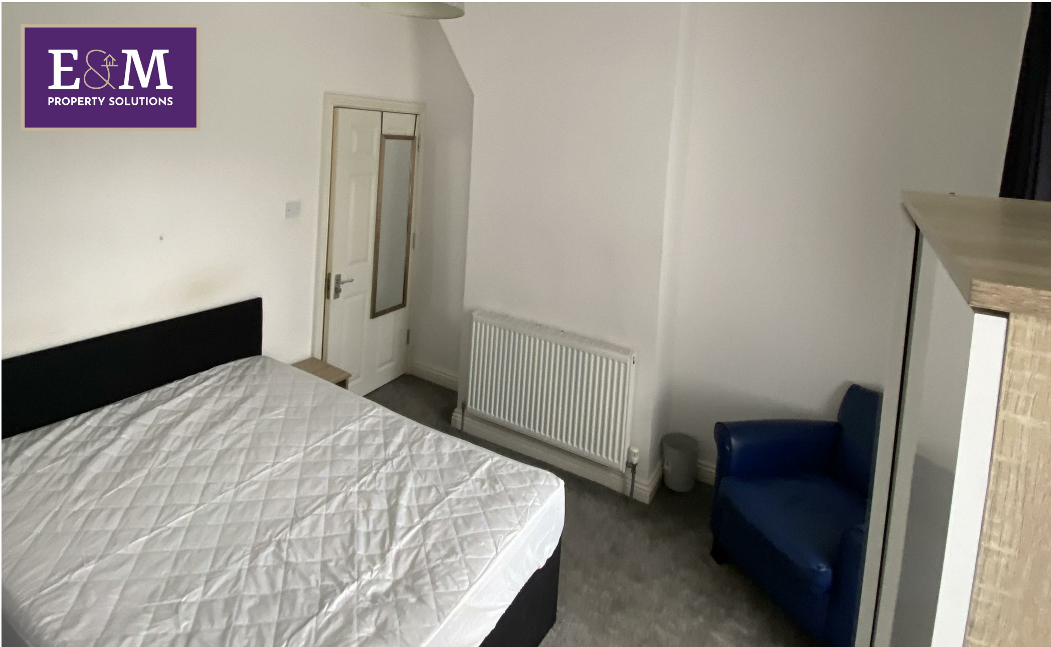
Room 2, 227 Coal Clough Lane, Burnley, Lancashire, BB11 4DL £140 Per week