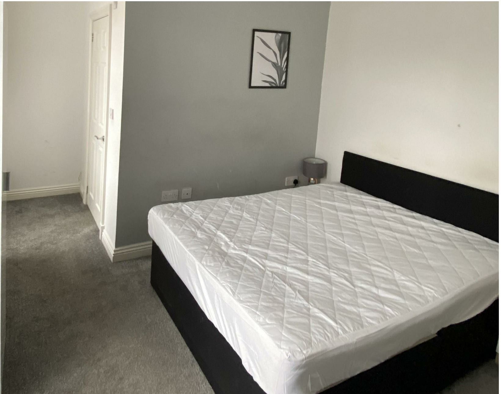
Room 2, 227 Coal Clough Lane, Burnley, Lancashire, BB11 4DL £140 Per week